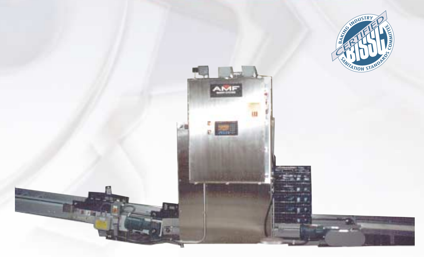
* Optional Operator Interface Shown